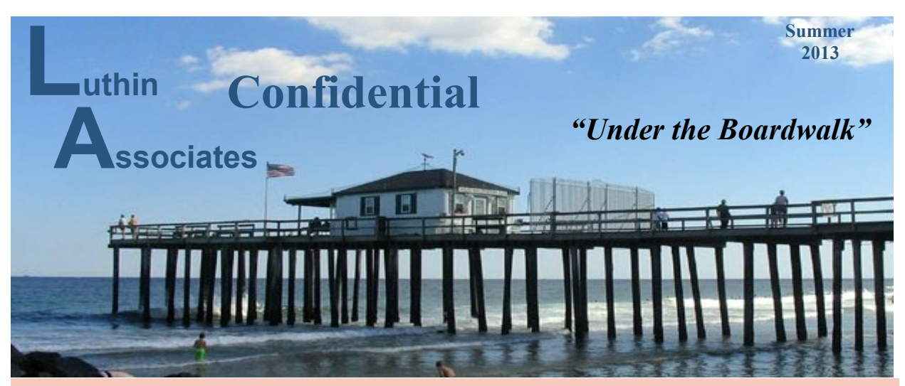
Getting Stronger than the Next Storm

Pictured above: Ocean Grove, NJ Fishing Pier, now in the process of being re-built.